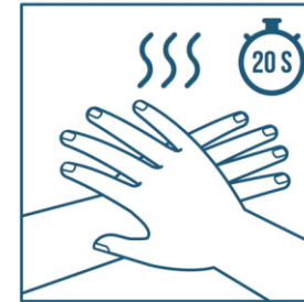
COVER ALL SURFACES UNTIL HANDS FEEL DRY (20 SEC)